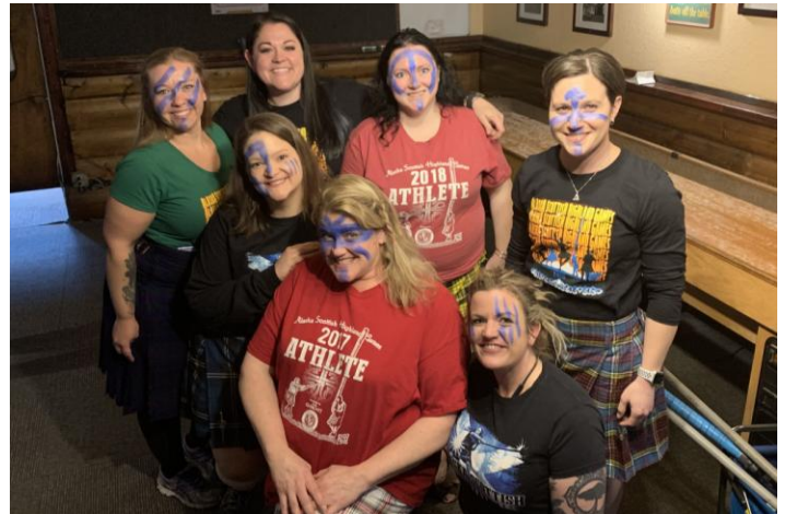
The Lady Hammerheads pose after the "Who Let the Girls Out" Fashion Show in Palmer

Yes they did! In addition to all the exciting games & competitions, the pipe & drum bands, the ceremonies, the live music, the storytelling, and the scotch tasting, to name a few. There will also be the Celtic Dance Stage! Located in Celtic Village, we plan to have lots of talented dance performers throughout the day, including highland dancers, step dancers, and clog dancers. Come be entertained, meet the performers, and maybe find out about dance lessons available in your area for yourself and/or your kids! Some of the dance groups anticipated this year include: Red Hackle Highland Dancers, Irish Dance Academy of Alaska, Midnight Sun Cloggers, Alaska Treble Makers, and Northern Lights Celtic Dancers.