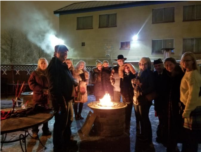
Gathering around the fire at Hogmanay, January 5, 2019