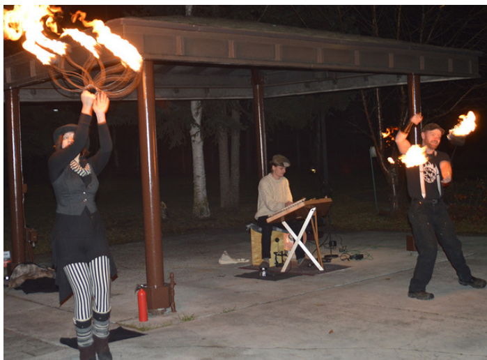
The Alaska Fire Circus performs at the CCA's Samhain celebration at the Senior Center in October